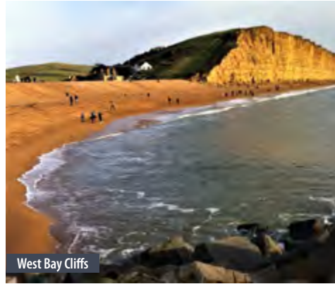
West Bay Cliffs