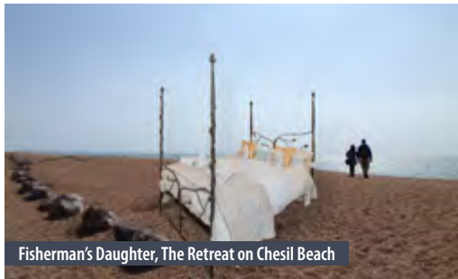
Fisherman's Daughter, The Retreat on Chesil Beach