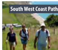
South West Coast Path