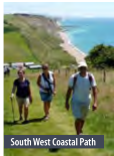
South West Coastal Path