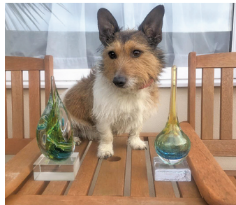
Nipper on a Gold Award Holiday

Well equipped bungalows including cooker, crockery, glasses, cutlery, refrigerator, microwave, Large T.V., duvets, pillows, mattress protector, tea towel and towelling bathmat. Please book our Linen & Towel Service, available at £35 per bedroom. Vacuums, hair dryers, irons, ironing boards are available from reception. Communal on-site outdoor dog shower available.