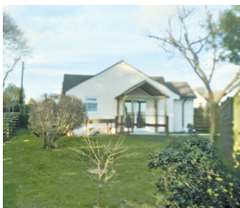
The New Garden Suite, comfortable & peaceful