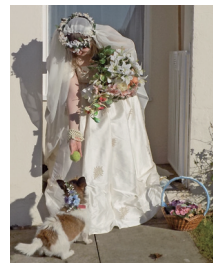
Honeymoon with your pets Full comfort upgrade available